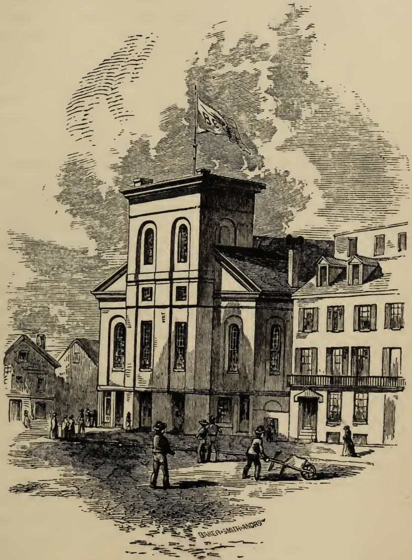
THE SEAMEN'S BETHEL, ERECTED BY THE BOSTON PORT SOCIETY, A. D. 1833.